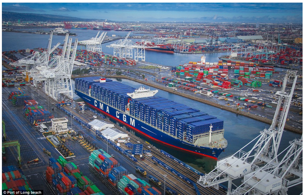
Figure 1. CMA CGM Benjamin Franklin at Port of Long Beach